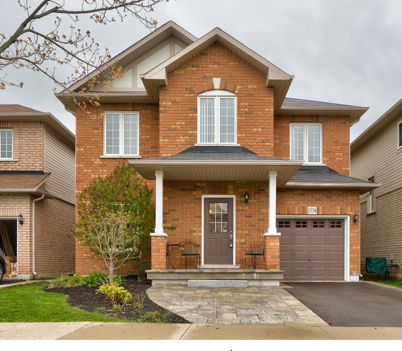
2336 Orchard Road | Burlington