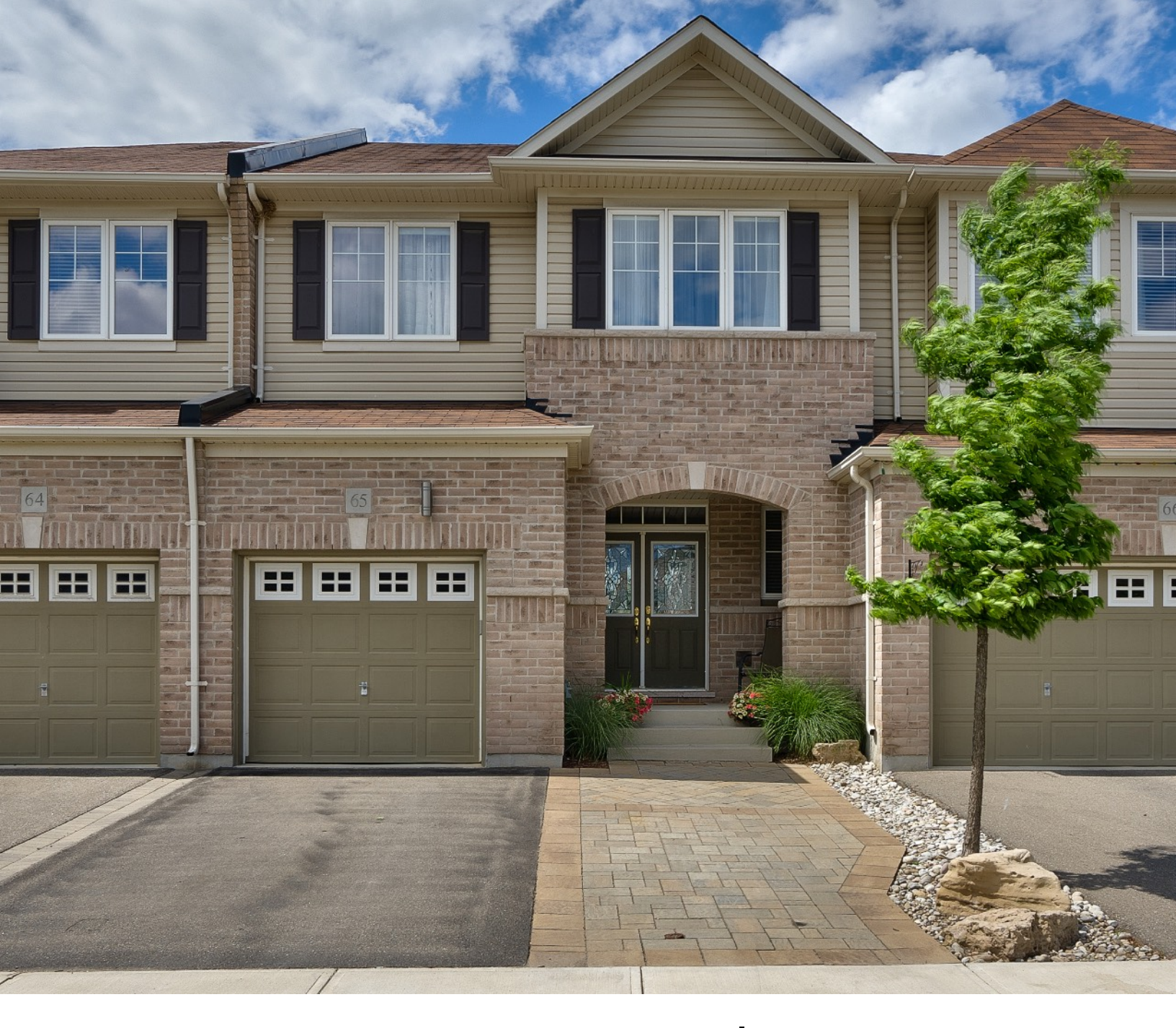
#65-2019 Trawden Way | Oakville