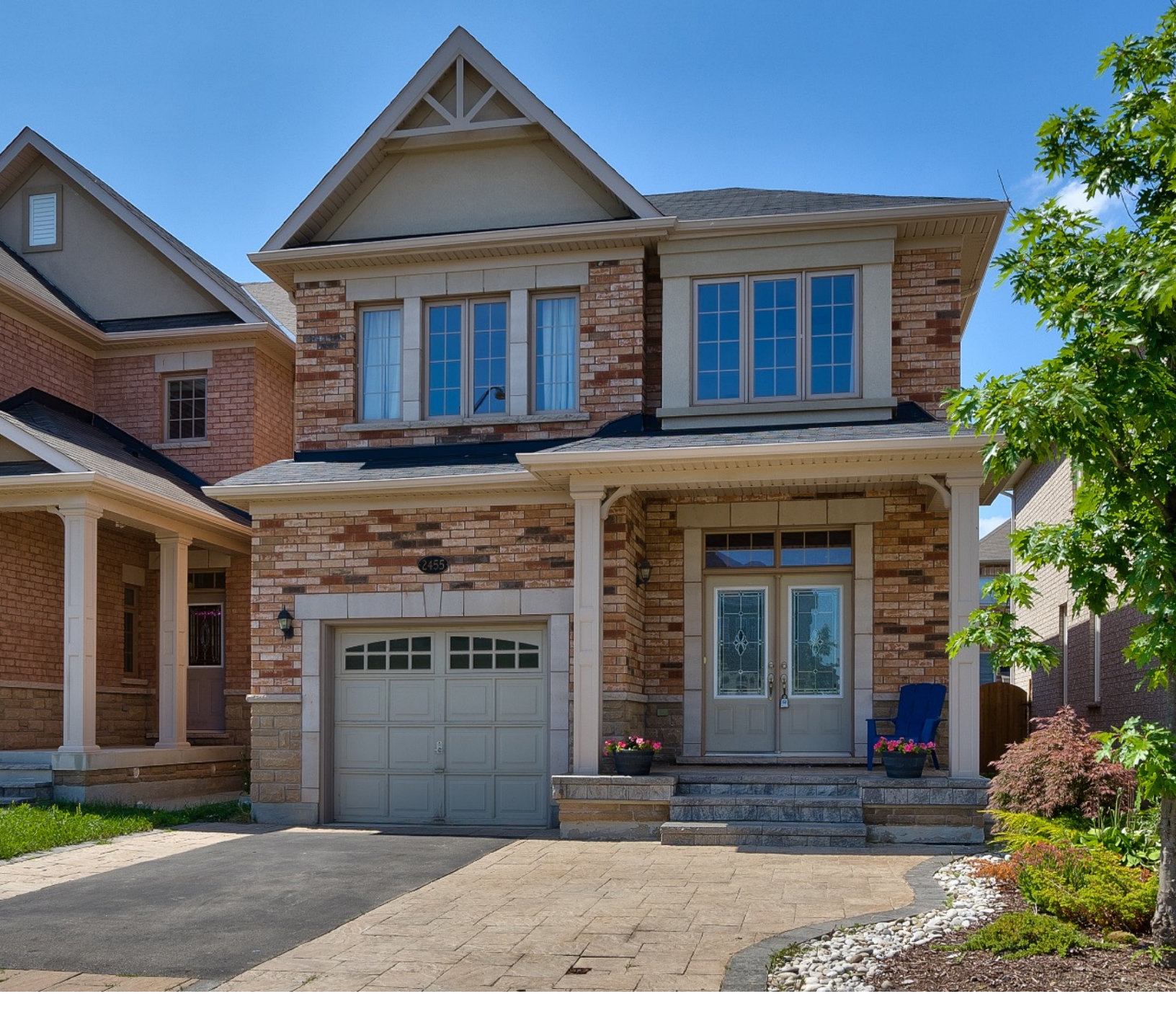
2455 Pine Glen Road | Oakville