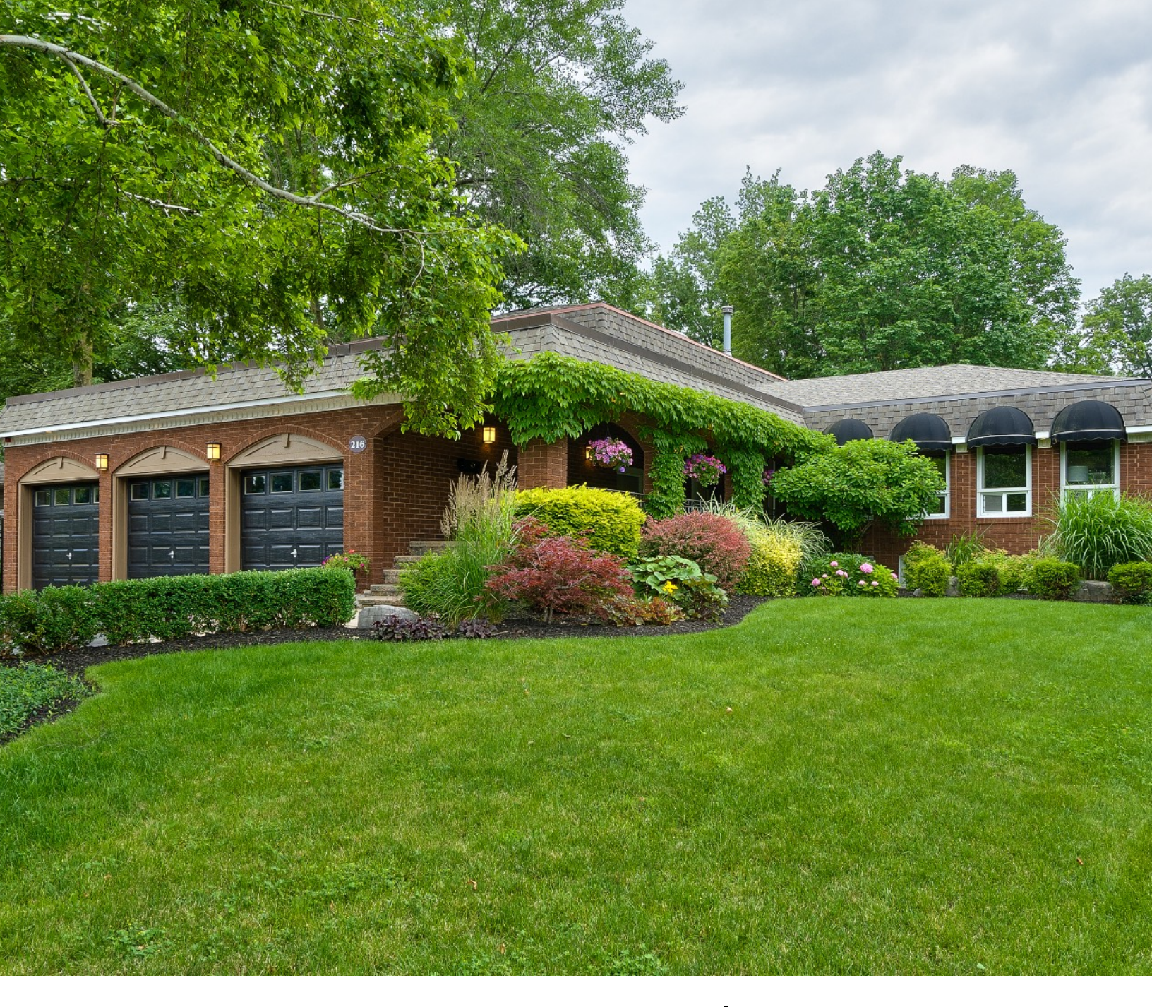
216 McCraney Street W. | Oakville